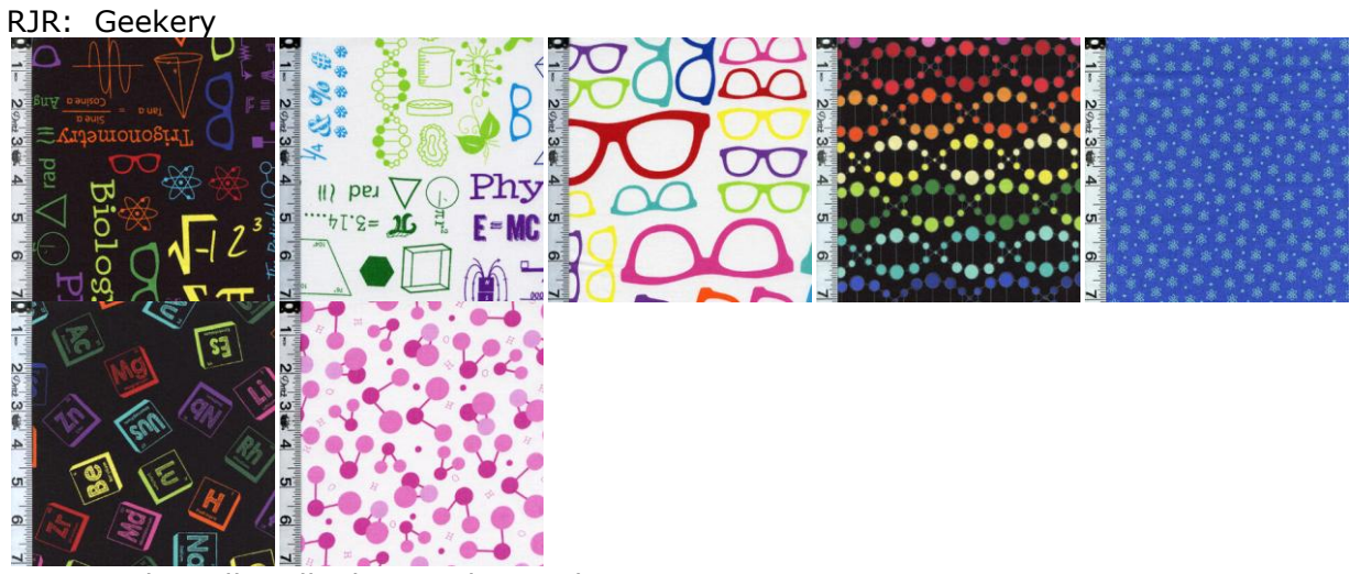
From Moda--jelly rolls, layer cakes & charms