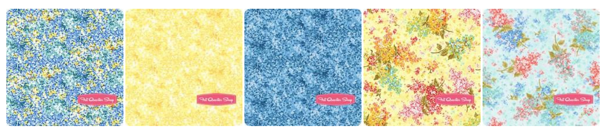
Also from Benartex are 2 1/2" strips called Dreamscapes. Couldn't grab a pic.